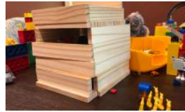
EMPEROR BLUE EYES' CABIN ON THE FRONT LINES