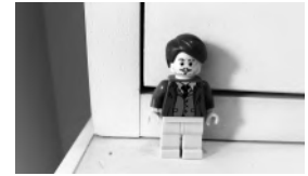
REMUS LUPIN IN BINGO (PICTURE SHOT IN 1957)