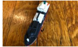
A CONTAINER SHIP NEAR THE PORT OF TRANQUILITY