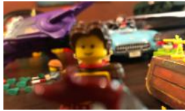
GENERAL KNIGHT ON THE FRONT LINES